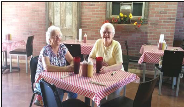
The My Meal-My Way senior dining site at Ziggy’s BBQ & Ice Cream Parlor in Oregon offers a new approach to affordable, nutritious, and unique senior dining.

***Elder Benefit Specialist (EBS) Program